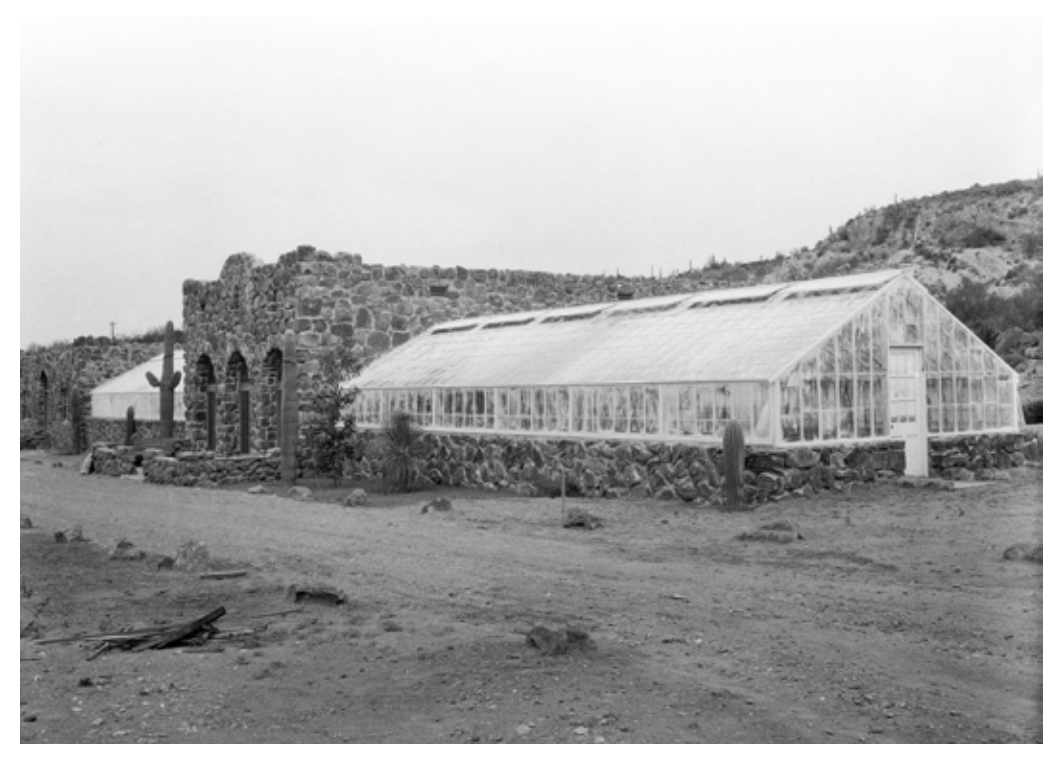
Smith building and greenhouse, 1926

plants of the Southwest were contemplated as plants from around the world were added to the list.