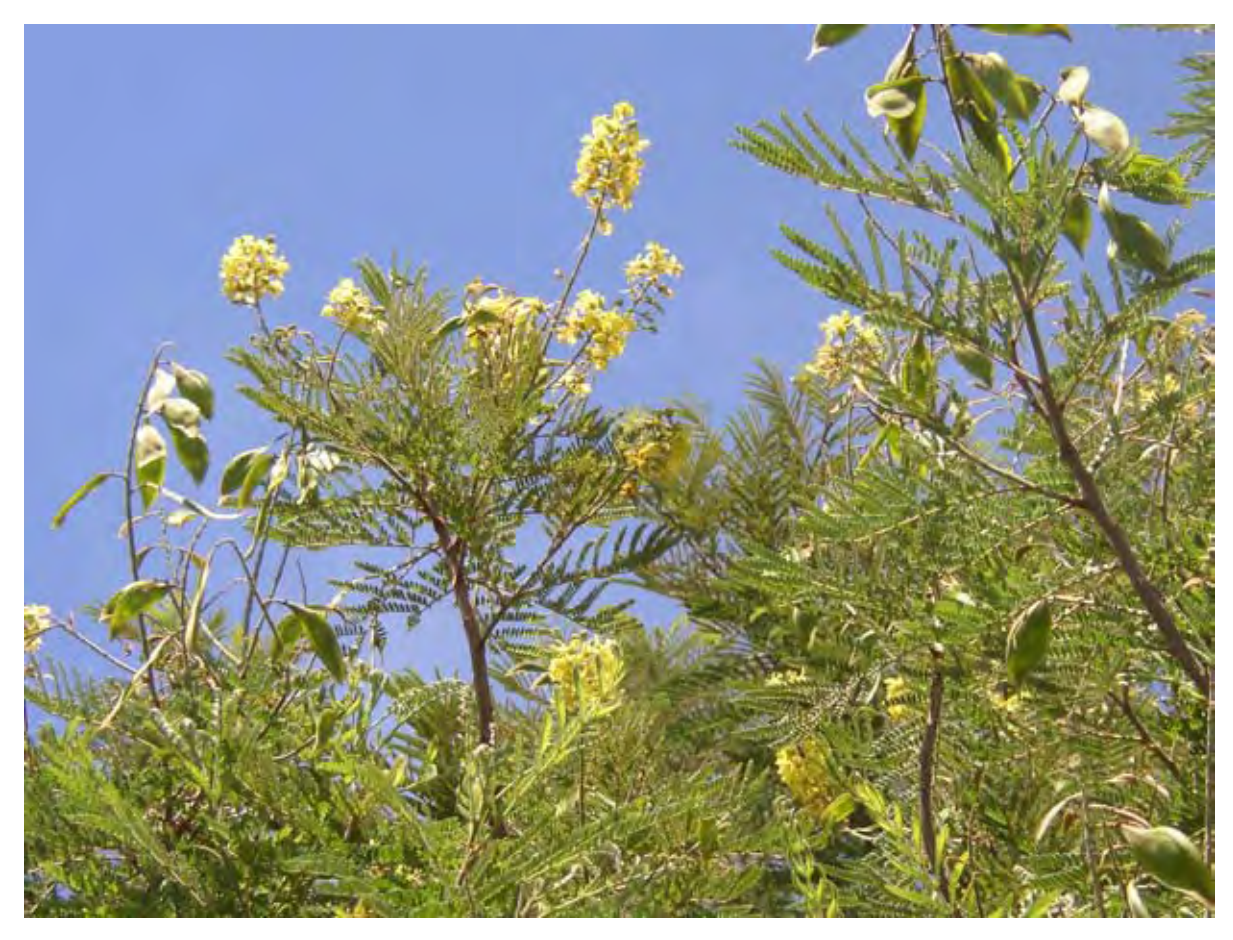
Prolific flowering Peltophorum africanum (KC)