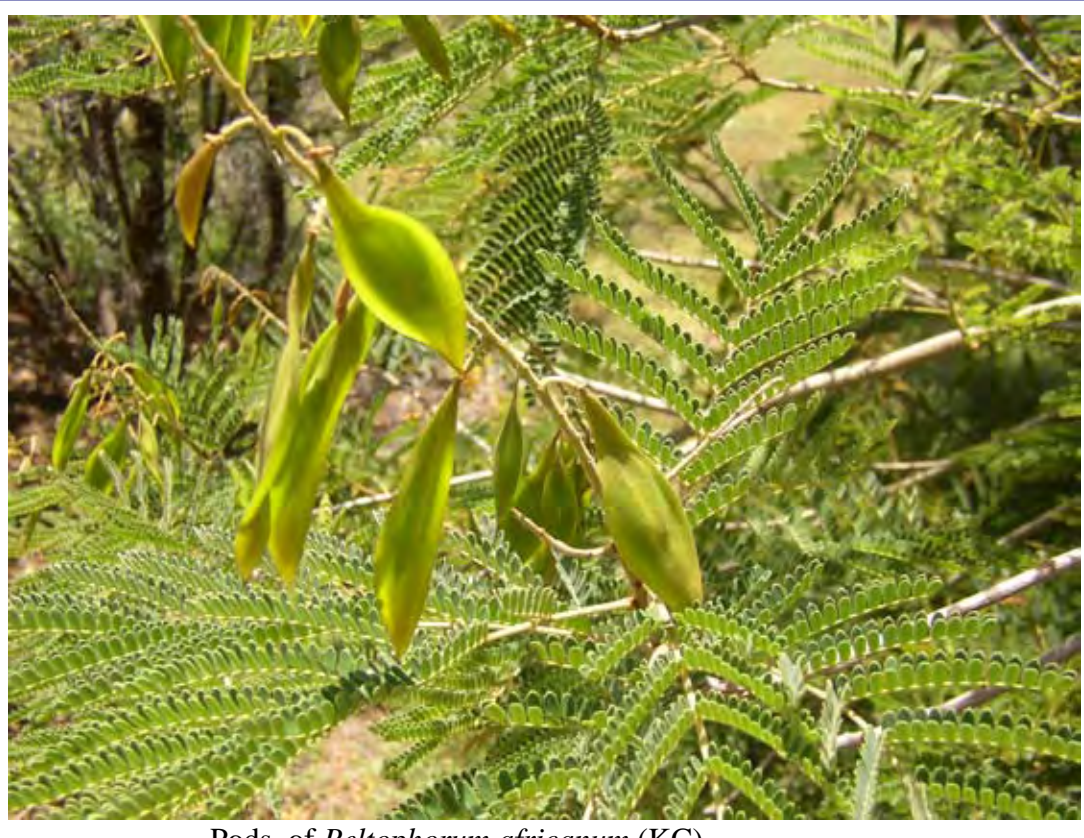
Pods of Peltophorum africanum (KC)

NON-PROFIT ORGANIZATION U.S. POSTAGE PAID PERMIT NO. 190 TUCSON, ARIZONA