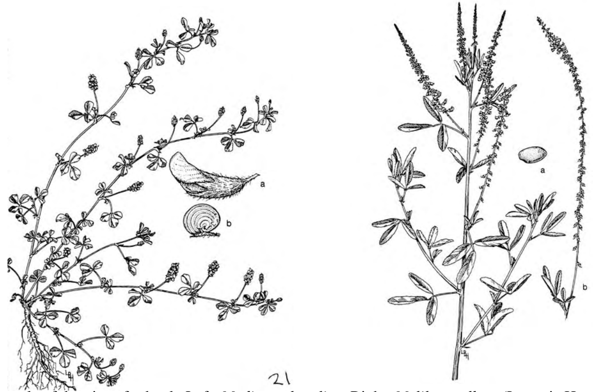
Sample of drawings for book. Left: Medicago lupulina. Right: Melilotus albus. (Lucretia Hamilton).