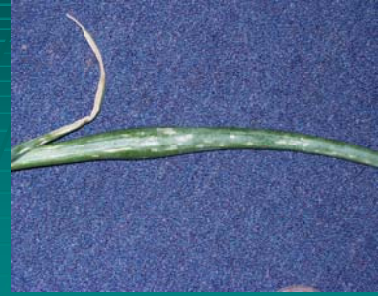
Sample from Yuma