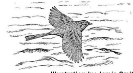
Illustration by Jamie Smith

The best poster is simple yet makes your work stand out!