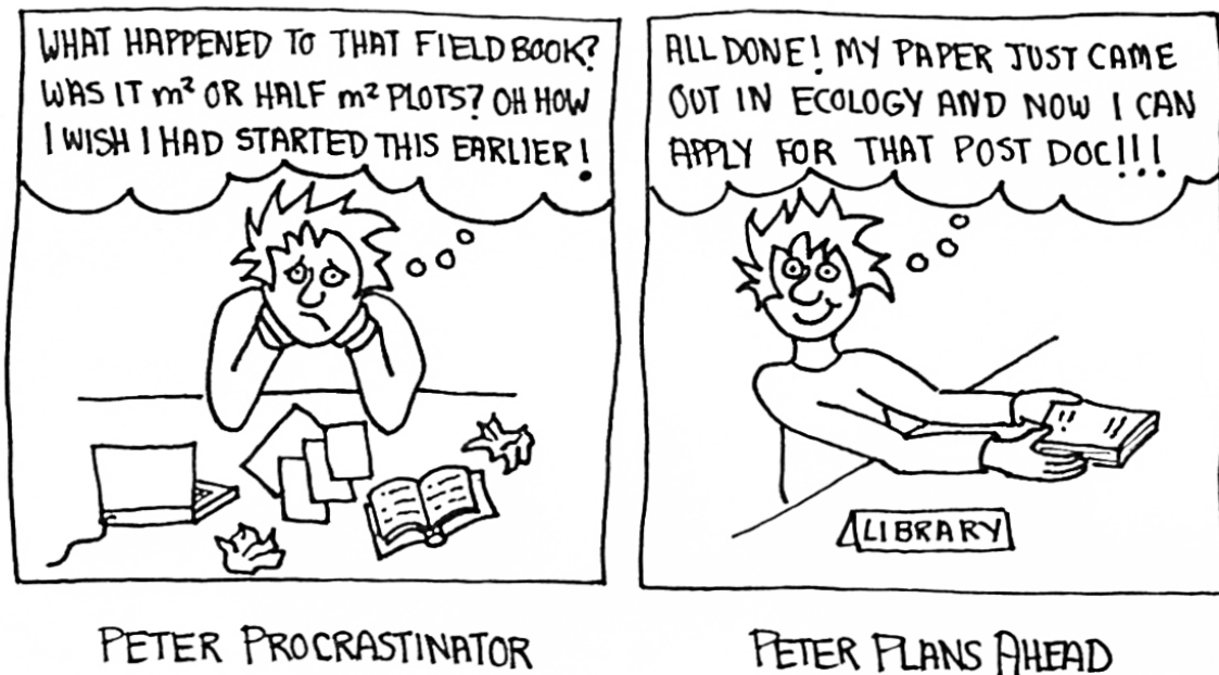
Fig. 3. By planning ahead with thesis writing you can avoid become a Peter or Petra Procrastinator.

two blind alleys, and a brief account of these failures may be useful to others. Appendices can be used to archive information that may still be insufficient for a manuscript or thesis chapter, but potentially of use later or to others.